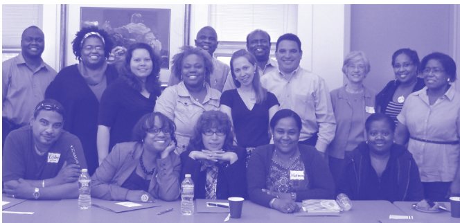
Cambridge Housing Authority staff.