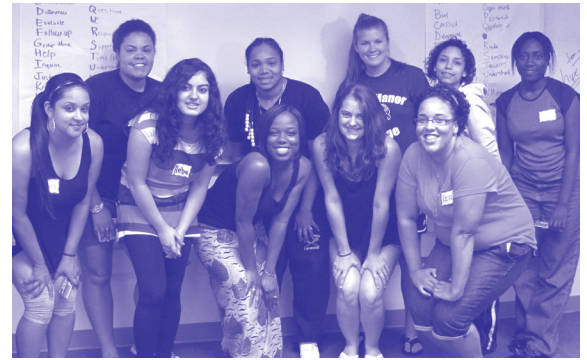
Pine Manor RA's.