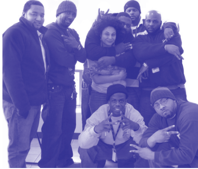
Boston Streetsafe Streetworkers.