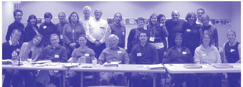
33 Hour Mediation Training Spring 2011.