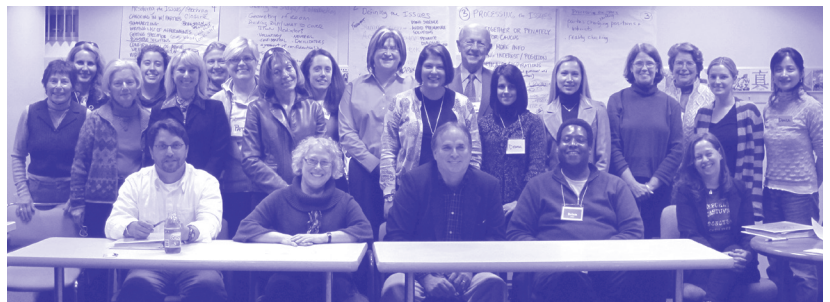
33 Hour Mediation Training Fall 2010.