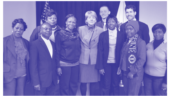
Nigerian Delegation with MA Attorney General Martha Coakley.