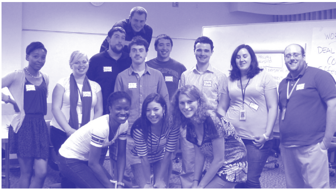
MA International Academy RA's.