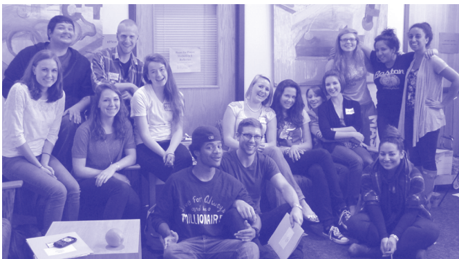
MA College of Art and Design RA's.